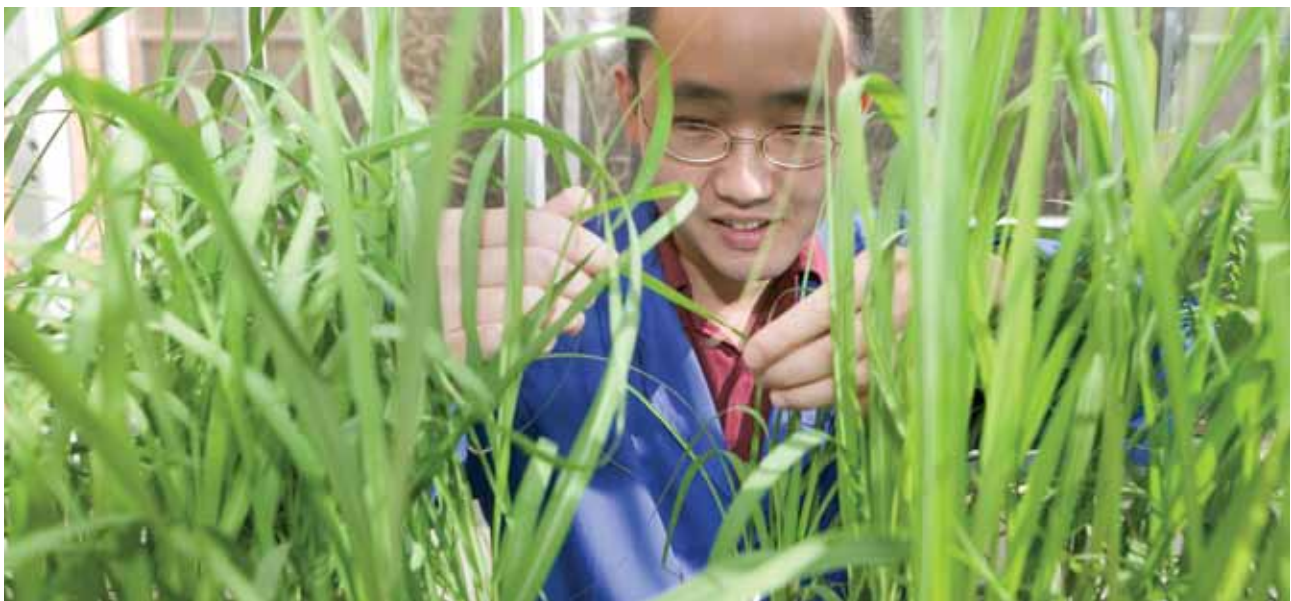
Sugarcane field research.

The NPBDS, together with the overarching NPBS, has been developed recognising the Intergovernmental Agreement on Biosecurity (IGAB). This agreement between the Australian, state and territory governments, aims to strengthen the working partnership between governments, broadly identifies their roles and responsibilities and outlines the priority areas for collaborative effort to improve the national biosecurity system. Implementation of the Recommendations contained within this NPBDS will complement and deliver on a number of priority reform areas of the IGAB (see Table 1).